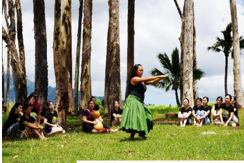
Nā Hoʻokupu Hula...Mahalo