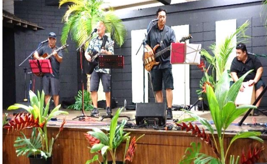
Dinner Music by "Flat Tires" for the night...